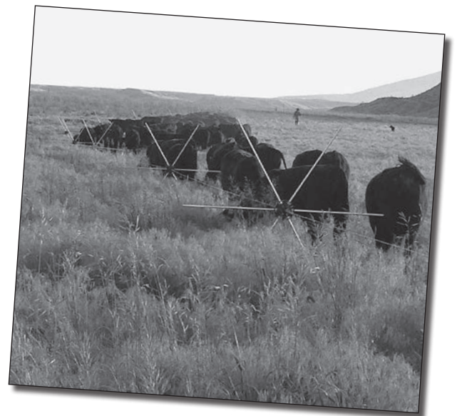
Bulls are adapted to many variations of cell grazing.

Dam Prod - 1 BR 89, 1 WR 96 GDam Prod - 6 BR 102, 5 WR 98 Dam ave. weight (4 yrs+) : 1150 Granddam ave. weight (4 yrs+) : 1009