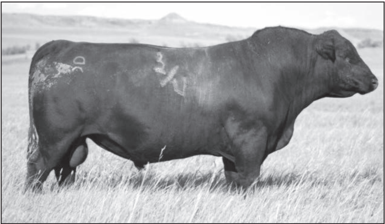
Indreland EXT 3653 purchased by Dietz Family Angus at our 2014 Sale

According to the Fall 2018 Sire Evaluation Report, the average for $EN in the Angus breed for non-parent bulls is -6.39. Our average $EN for our registered sale bulls is +18.69. With the rising cost of feed, we think the $EN number should really be evaluated and in our opinion, is the first step to low input production.