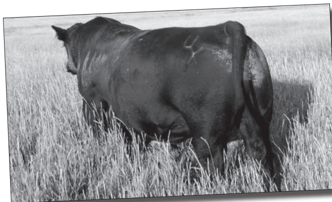
They grow up to be beef bulls!

Dam Prod - 6 BR 98, 6 WR 106, 1 YR 107 GDam Prod - 4 BR 99, 4 WR 100, 1 YR 105 Dam ave. weight (4 yrs+) : 1080 Granddam ave. weight (4 yrs+) : 982